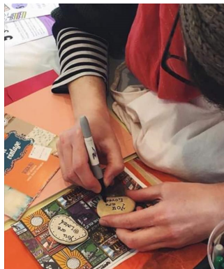
Fabric painted tote-bags and encouragement stones.